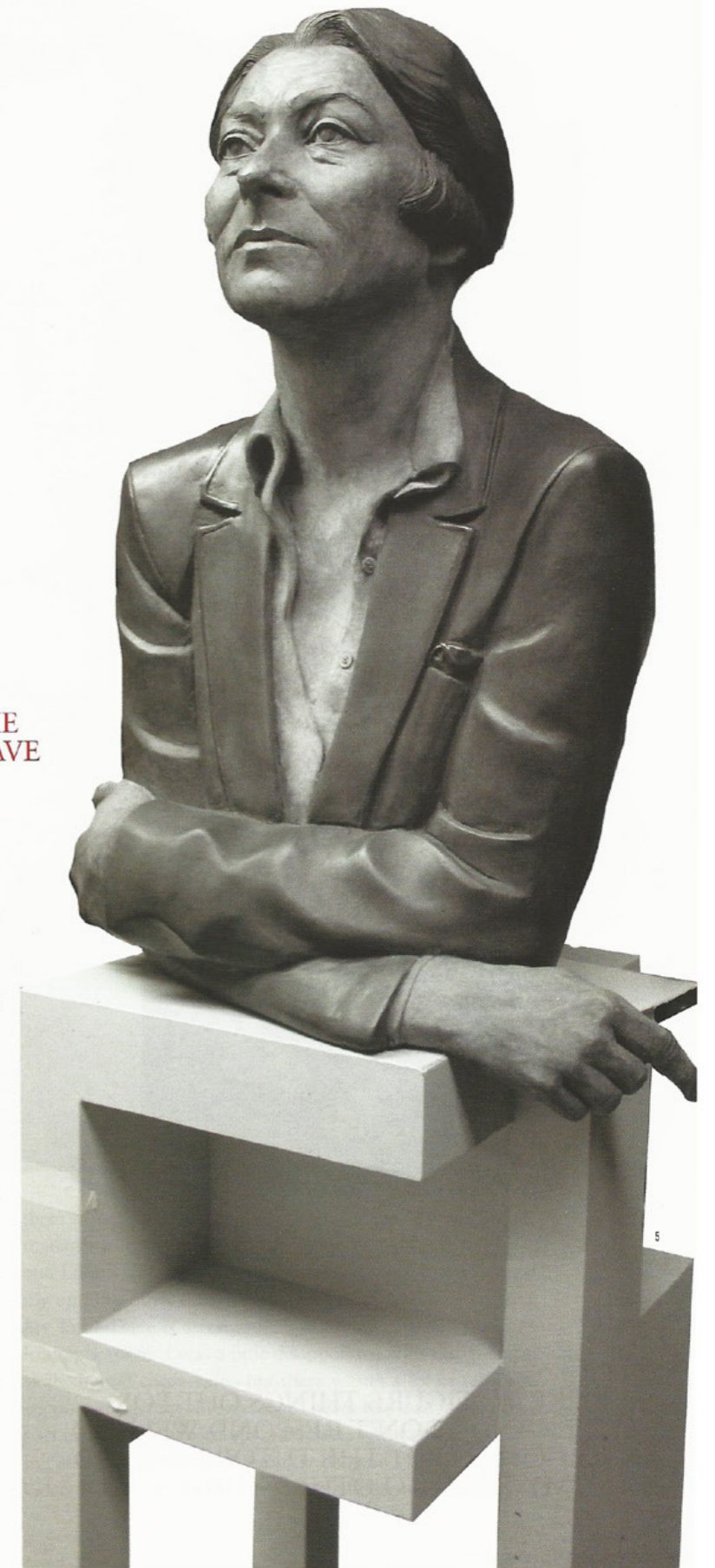
5 EILEEN GRAY 2018 edition of 3, bronze on bespoke concrete plinth 74x54x42cm.