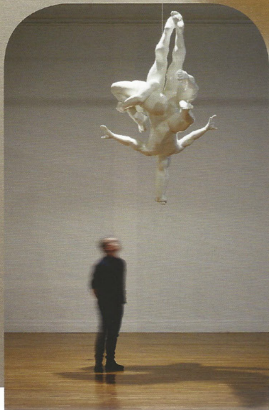
1&2 VERA KLUTE PLUNGE 2017 carved polyurethane foam, silicone 250x150x150cm.

'Everything that is beautiful has something creepy about it or something unsettling underneath,' Vera Klute talks to Brian McAvera about her aesthetic